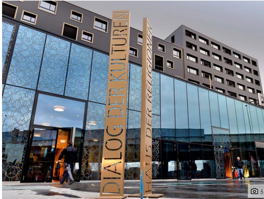
The Haus der Religionen, Bern ( Haus der Religionen )